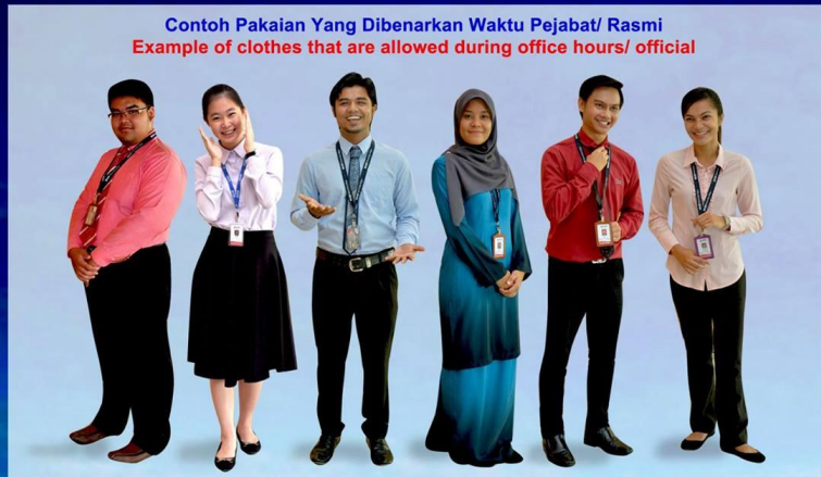
Contoh Pakaian Yang Dibenarkan Waktu Pejabat/ Rasmi Example of clothes that are allowed during office hours/ official

Menghadiri kuliah, tutorial & menduduki peperiksaan Berurusan di Jabatan/ Perpustakaan/ Pusat Pengajian/ Pusat, Bahagian & Inapan Siswa (INASIS) Attending lectures/tutorials & sitting for examinations Conducting business at Departments/ Academic Schools/ Centre/ Divisions & DPP offices