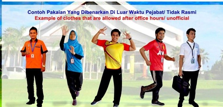
Contoh Pakaian Yang Dibenarkan Di Luar Waktu Pejabat/ Tidak Rasmi Example of clothes that are allowed after office hours/ unofficial

Menghadiri kuliah, tutorial & menduduki peperiksaan Berurusan di Jabatan/ Perpustakaan/ Pusat Pengajian/ Pusat, Bahagian & Inapan Siswa (INASIS) Attending lectures/tutorials & sitting for examinations Conducting business at Departments/ Academic Schools/ Centre/ Divisions & DPP offices